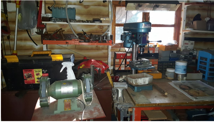
{Slide: Shed 3}